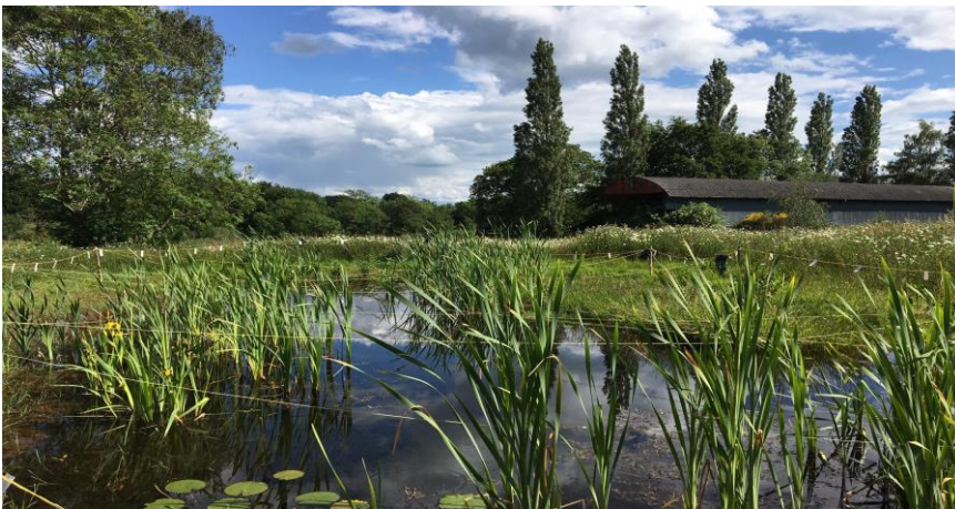
Wildlife habitat we've created at Finham Brook, Kenilworth

As part of preparing sites for the construction of HS2 we are undertaking a major conservation project to create a 'green corridor' alongside the route of HS2. This will include a network of habitats ranging from woodlands and meadows to wetlands and ponds. They will replace any habitats affected by the construction of HS2, while conserving and enhancing existing sites. We're committed to 'no net loss' in habitats for wildlife over the course of our works.